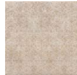
Insert 21 x 21 (21 1/4 x 21 1/4) F3Q345A251