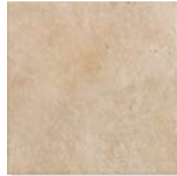
21 x 21 (21 1/4 x 21 1/4) F3QT45A041