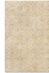
Insert 13 x 21 (13 1/8 x 21 1/4) F3Q346A041