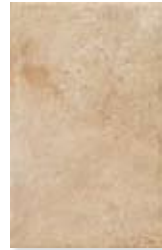
13 x 21 (13 1/8 x 21 1/4) F3QT46A041