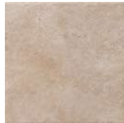
21 x 21 (21 1/4 x 21 1/4) F3QT45A251