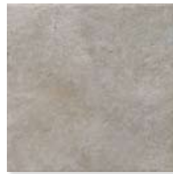
21 x 21 (21 1/4 x 21 1/4) F3QT45A021