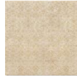
Insert 21 x 21 (21 1/4 x 21 1/4) F3Q345A041