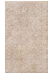
Insert 13 x 21 (13 1/8 x 21 1/4) F3Q346A251