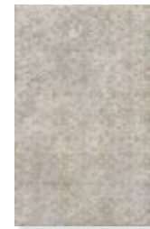
Insert 13 x 21 (13 1/8 x 21 1/4) F3Q346A021