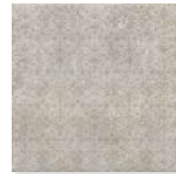
Insert 21 x 21 (21 1/4 x 21 1/4) F3Q345A021